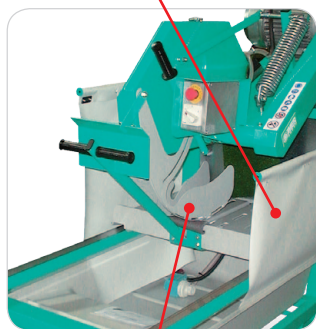
Blade lateral guards